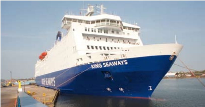
BE PREPARED/ WITH DFDS, NORTHUMBRIA POLICE AND THE FIRE & RESCUE SERVICE, WE HELD A SIMULATED EXERCISE WHICH WAS A HUGE SUCCESS IN TESTING OUR RESPONSE