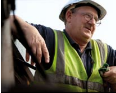
A DAY IN THE LIFE OF/ FRED PERRY TALKS ABOUT HIS TYPICAL DAY – P2