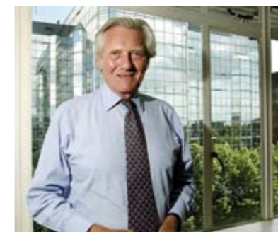
MICHAEL HESELTINE* Chair of the Regional Growth Fund