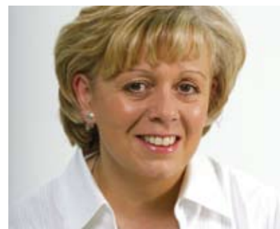
MARY GLENDON MP for North Tyneside