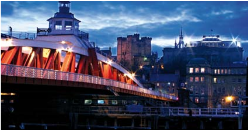
BACK IN THE SWING/ THE SWING BRIDGE IS BACK IN WORKING ORDER FOLLOWING THE REPLACEMENT OF HYDRAULIC RAMS WHICH WERE BROKEN IN THE FREEZING WINTER