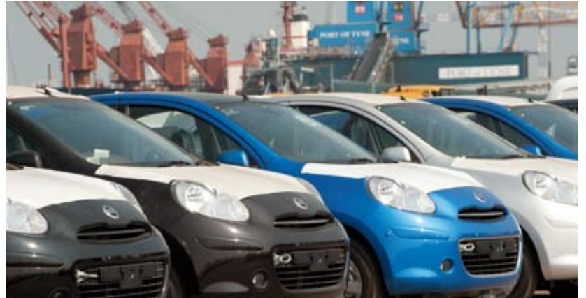
BRIGHT NEW CARS/ FEBRUARY SAW THE FIRST EVER SHIPMENT OF NISSAN'S ELECTRIC BATTERY CAR – THE LEAF