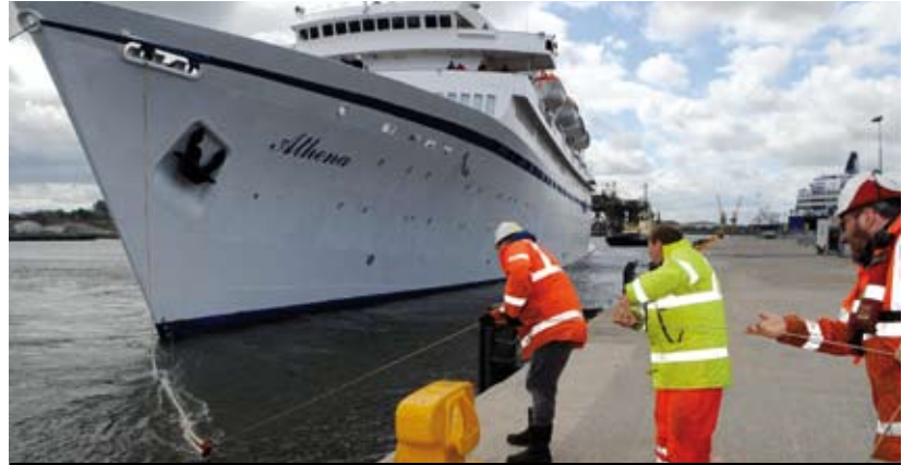
CRUISING TO SUCCESS/ CRUISE SEASON GETS UNDERWAY WITH THE ARRIVAL OF THE ATHENA ON THE 12 MAY. WE'RE EXPECTING MORE CRUISE CALLS IN JULY