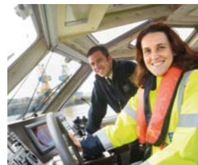
THERESA VILLIERS Shadow Secretary of State for Transport