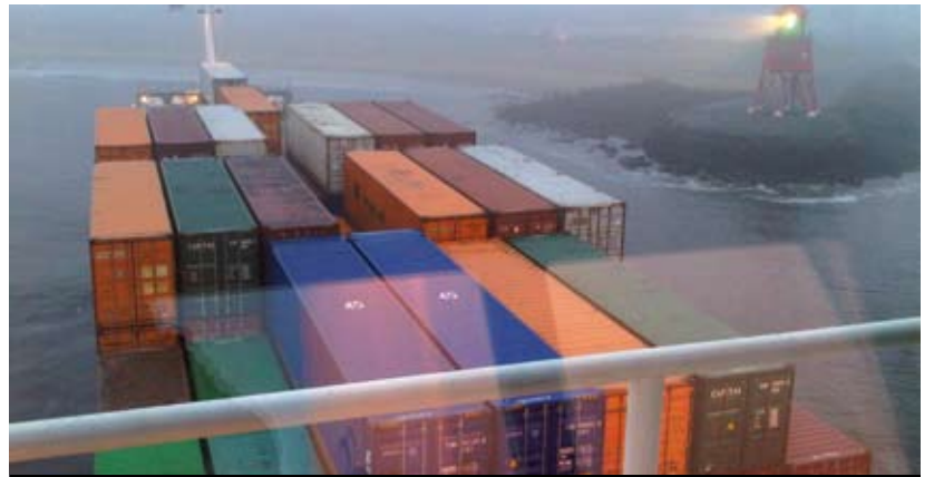
RESCUE OPERATION/ PORT OF TYNE CAME TO THE RESCUE OF THE CLONLEE IN MARCH, THE CONTAINER SHIP WAS GROUNDING AT LITTLE HAVEN BEACH DUE TO POWER FAILURE