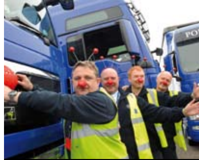
COMIC RELIEF 2011/ GETTING INTO THE SPIRIT RAISES OVER £6,500 – P10