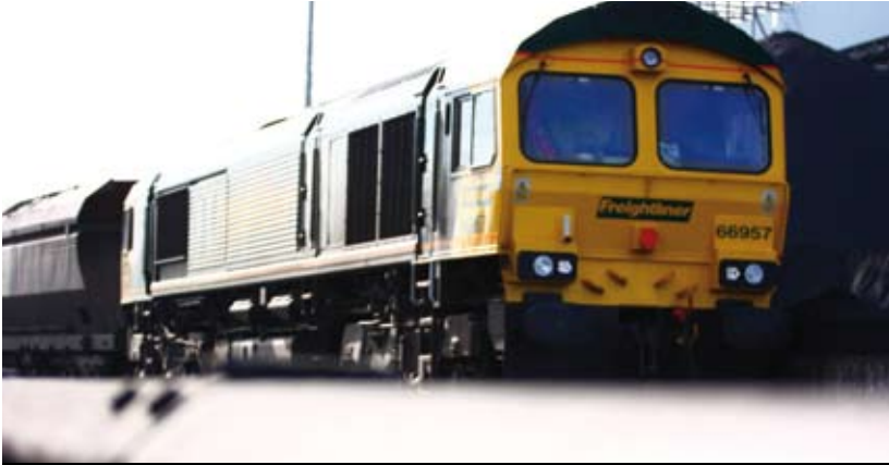
ROUND THE BEND/ THE BOLDON EAST CURVE REOPENED IN MAY SAVING TWO HOURS ON TRAIN TIMES LEAVING THE PORT THANKS TO A £1.6M UPGRADE BY NETWORK RAIL