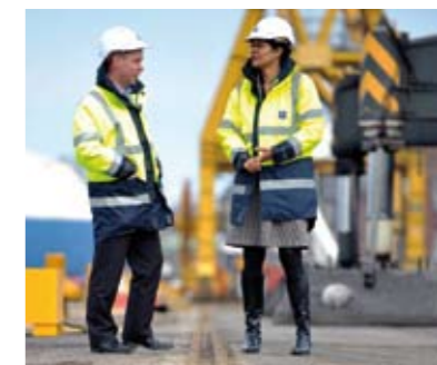
CHI ONWURAH MP for Newcastle Central