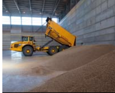
HANDLING A NEW CARGO/ WOOD PELLETS – A GROWING BUSINESS – P8