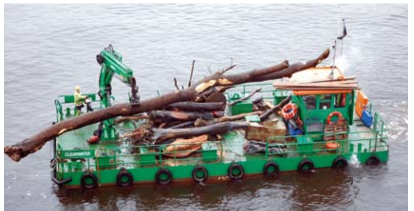
CLEAN TYNE/ THE CLEAN TYNE PROJECT REMOVED 245 TONNES OF DEBRIS LAST YEAR AND ALMOST 99% OF IT WAS RECYCLED