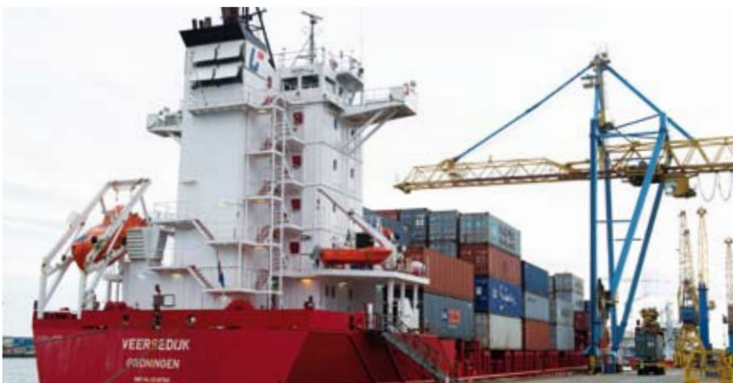
NEW DESTINATIONS TO PLACES YOU CAN'T SPELL/ CONTAINER CONNECTIONS OPERATED BY UNIFEEDER TO GDANSK, GDYINA & HAMBURG OPENED IN MARCH